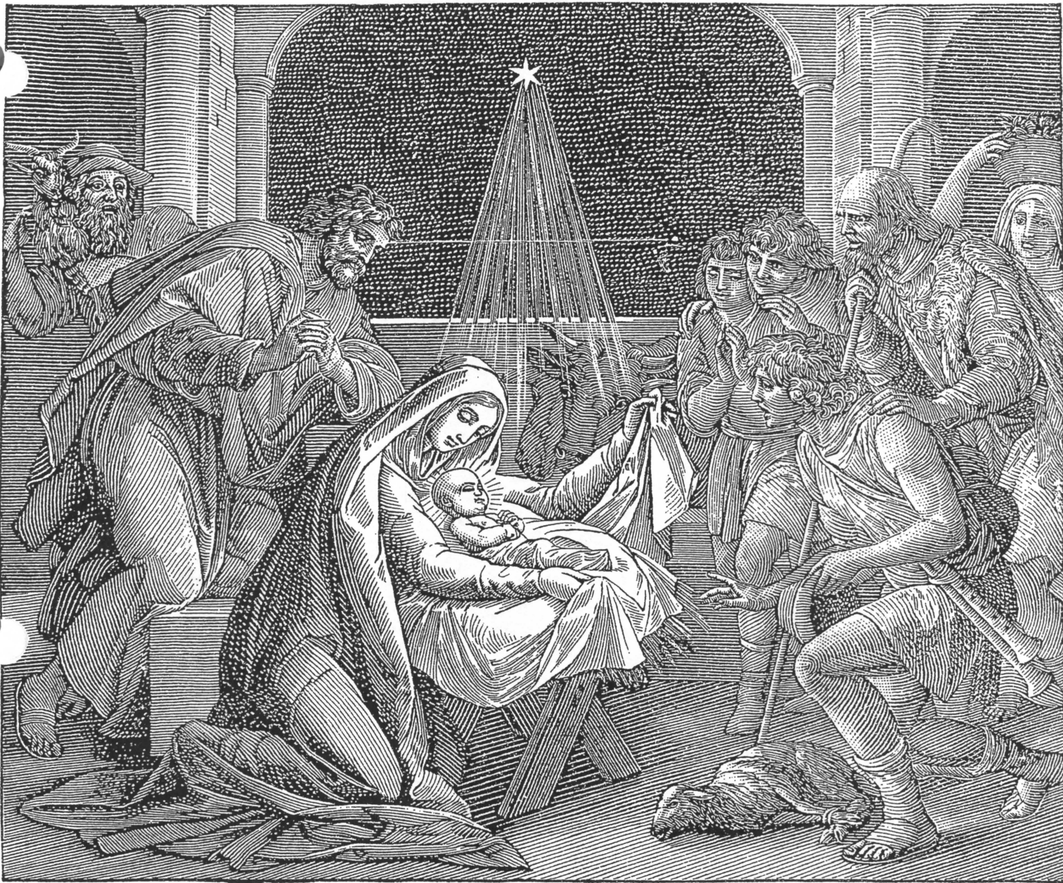
THE BIRTH OF JESUS.